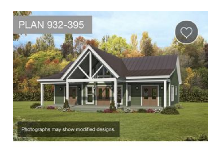
Home / Style / Ranch