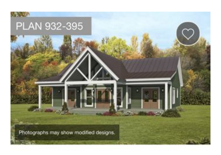
Home / Style / Ranch